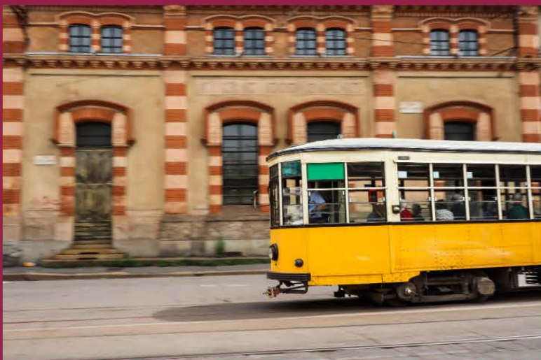
Photo of a tram in Milan